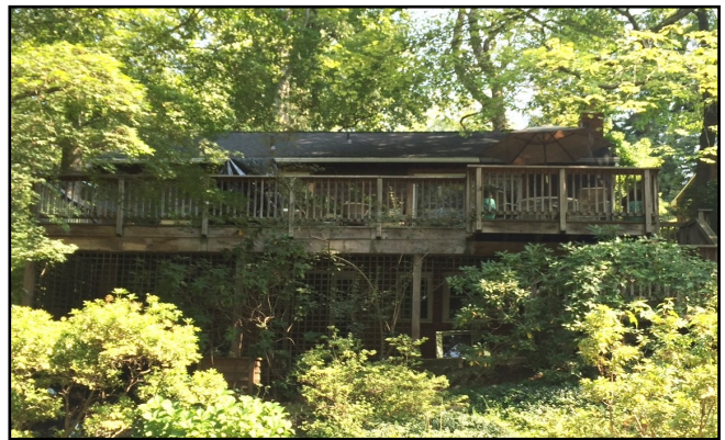
5223 Wyoming Road

Please contact me directly for more information about either of these exciting new offerings. And don't hesitate to reach out to me for a confidential consultation about your upcoming real estate plans and/or questions—I will be happy to help. Thank you for your support!