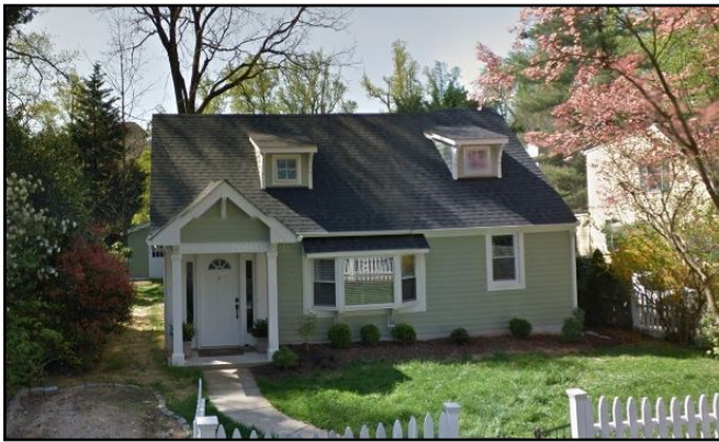
6202 Madawaska Road

There is a good chance that the local real estate market will catch fire earlier than usual in 2017 due to the strong demand that still exists and a subtle recognition that it may be to one's advantage to capitalize on the good buying and selling conditions that we have now. Fueling that activity will require new inventory and, to that end, I want to announce a couple of homes that I will be bringing to the market very soon: